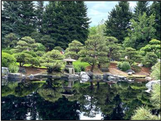
Japanese Water Garden at the Denver Botanic Garden

MONTANA WEATHER! What can I say? Summer is here and so are the sweltering temperatures. In my area we jumped from the lovely 70's and 80's to mid to upper 90's!!!! I have lived here since 2005 and I still am not sure when to plant tomatoes. With any luck I might get "green" tomatoes. That's not a bad thing cause down south we have a dish called "Fried Green Tomatoes".