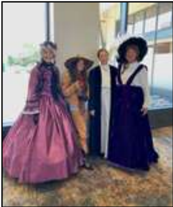
NGC presented entertainment by The Legendary Ladies – Unconventional Women of the West (pictured above). The ladies represented Calamity Jane (Frontierswoman 1852-1903), Margaret Brown "Unsinkable Molly Brown" (Philanthropist 1867-1932), and Katharine Lee Bates who wrote "America the Beautiful" (Poet 1859-1929).