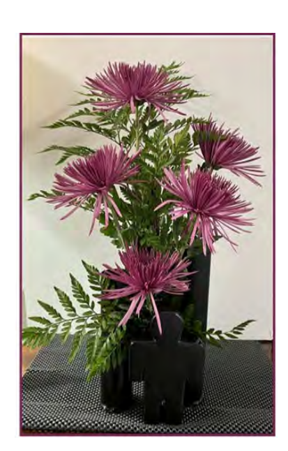
Many more pictures from the 2023 convention and district meetings are available at the MFGC website under Publications. mtfgc.org