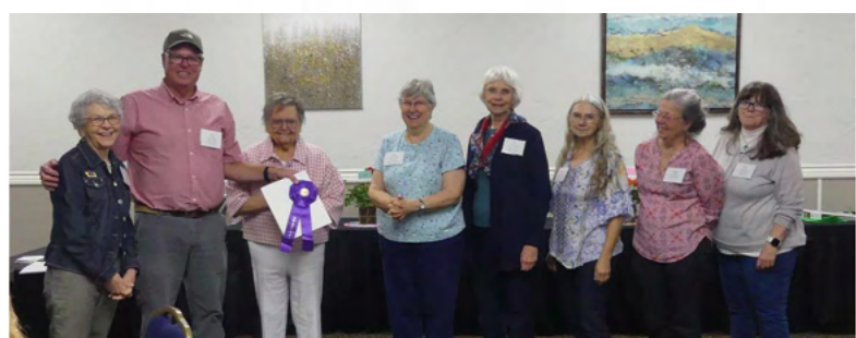
Thumb-R-Green Garden Club in Billings won a National Garden Clubs, Inc. Standard Flower Show Achievement Award for their show entitled "Hats Off to Our Heroes"