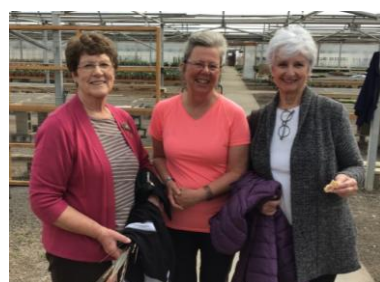
Fun at the Yellowstone Meeting