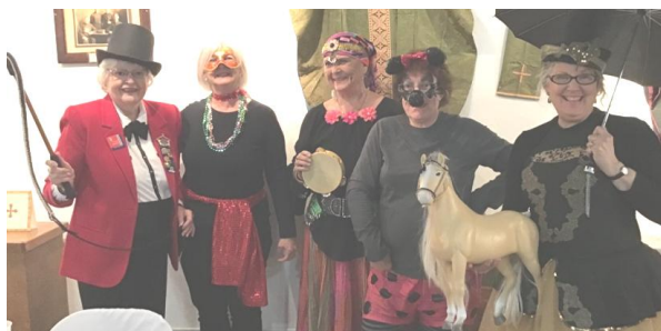
Whitehall Garden Club