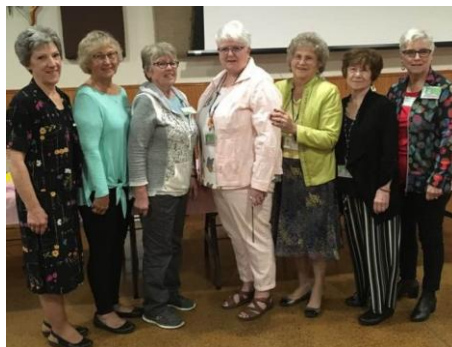
Dearborn Garden Club