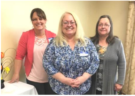
Toole County Garden Club