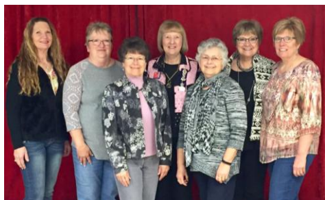
Glendive Garden Club

Pictured below and on the next page are group pictures of men and women in our garden clubs throughout the state of Montana who gathered for a good time and interesting programs during the District Meetings of the MFGC.