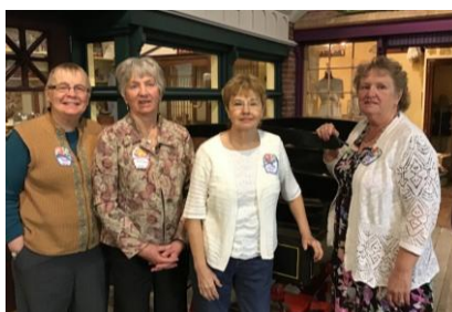
Malta Dirt Daubers