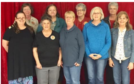
Miles City Garden Club