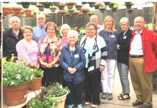
Missoula Garden Club