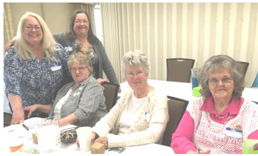
Conrad Garden Club