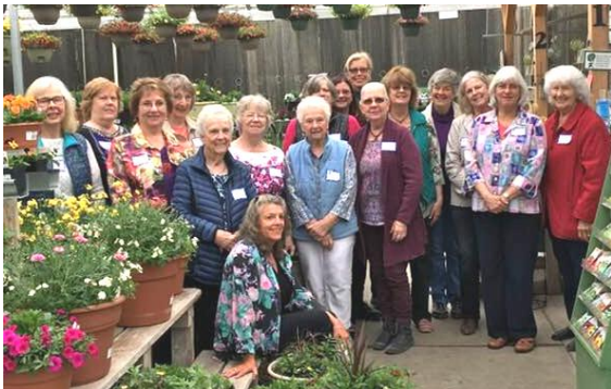
Stevensville Garden Club