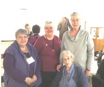
Dillon Garden Club