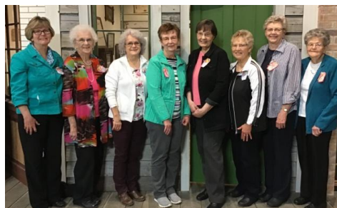
Saco Garden Club