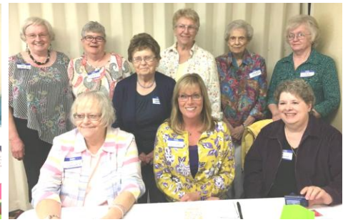
Chester Garden Club