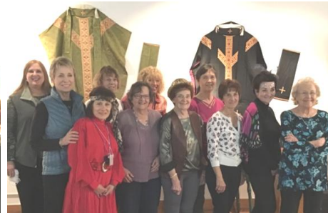
Anaconda Garden Club