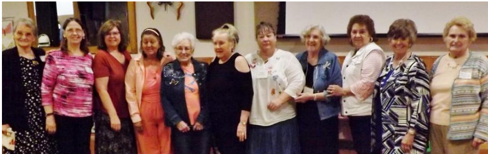
Rainbow Garden Club (above) Great Falls Flower Growers (below)