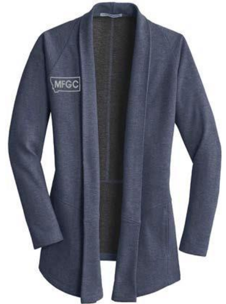
Color shown is Estate Blue Heather

If you are like me, I am always chilly attending meetings in the larger convention centers. Having a nice attractive sweatshirt cover up like this will help keep us warm and promote MFGC!.