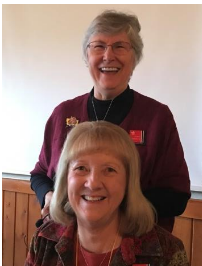
Our MFGC President and President-Elect are all smiles at the end of a very successful Fall Board Meeting