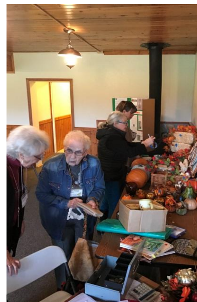
Those who attended the Fall Board had a great selection of bargains to take back home at the Ways and Means tables!