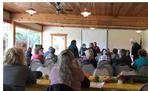
The Western Conference Center in Ennis was a beautiful venue for the Fall Board Meeting!