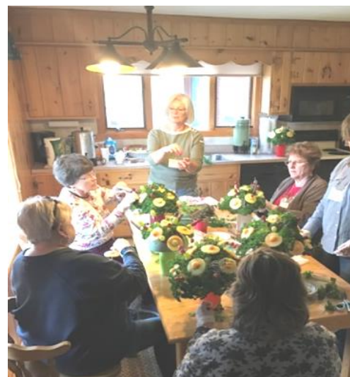
Belgrade and Whitehall members have fun creating the beautiful "Incredible Edible" centerpieces for the Fall Board