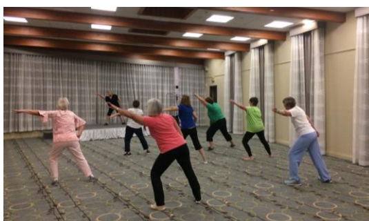
Convention Pictures (Top to Bottom) Blue Star Memorial Ceremony; Chadwick Nursery Tour, Officers Head Table, Bullhook Blossoms, and the morning exercise option.