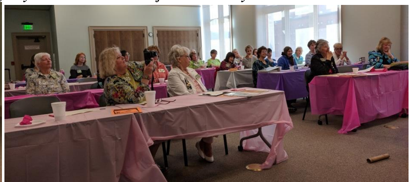
(left) Combined members of Butte and Anaconda (right) District 3 and 4 members during the program presentations.