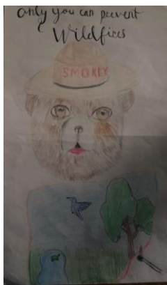
Jude Imlay, 5 th