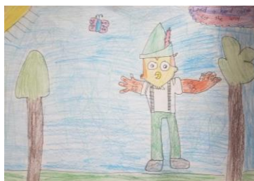
Renzey Raymond, 3 rd Grade