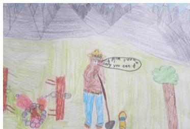
Trevor Knowles, 2 nd Grade