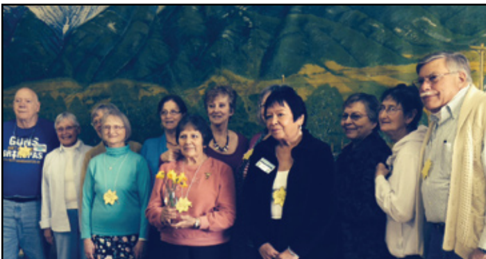
Mission View Garden Club