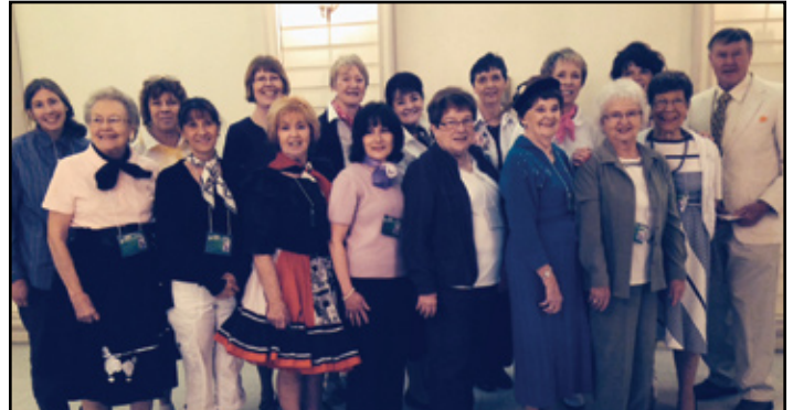
Anaconda Garden Club

With song and style the Anaconda Garden Club hosted the Southwestern District Meeting. We were treated to 50's music, history and a style show. What a wonderful time!