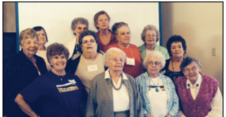
Rainbow Garden Club