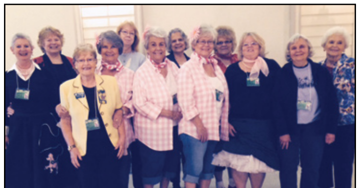
Whitehall Garden Club