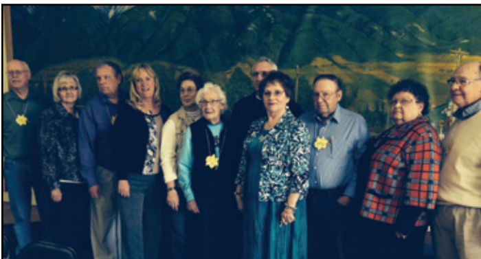
Missoula Garden Club

Western District met in Charlo hosted by Mission View G.C. on April 15. The location was the Historic Leon Hall. We had Doukhobors soup ( Google that ). We had a program on the Leon Hall and after the meeting toured Charlo Park, a long term project of the Mission View Garden Club. There have been several grants over the years from National to support this project. The park provides the only place in town where family and friends can congregate and picnic. We hope to provide support for their new project to provide a covered shelter. We haven't had a State project for a while. We'll keep you updated at convention.