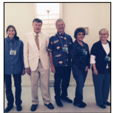
Butte Garden Study Group