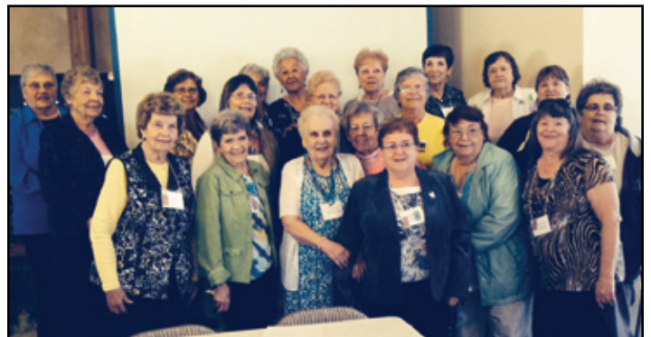
Great Falls Flower Growers