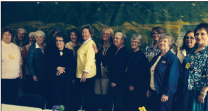
Stevensville Garden Club