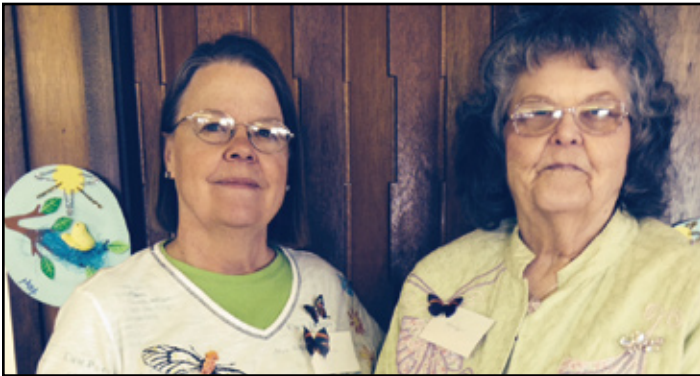
Conrad Garden Club