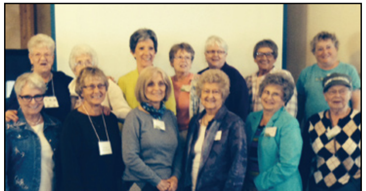
Dearborn Garden Club