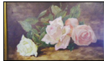
Painting of Roses to the Butte Archives