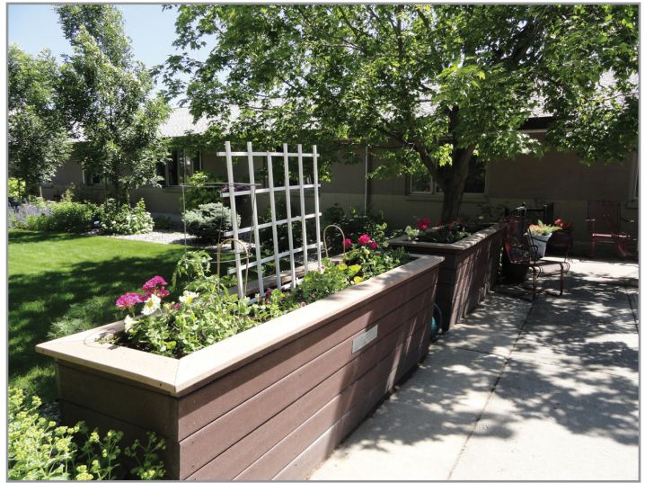
Raised beds at the Gallatin Retirement Center enable residents to tend vegetables and flowers they plant.