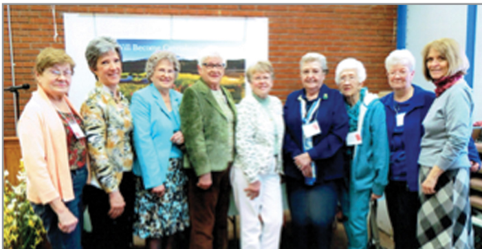
(Pictured above top) Members of the Great Falls Flower Growers (Center) Members of the Rainbow Garden Club (Bottom) New to the Central District are members of the Dearborn Garden club (Pictured below) Conservation program presented at the Central District Meeting