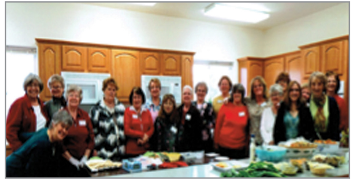
(left) Western District - Missoula Garden Club (right) Western District- Stevensville Garden Club