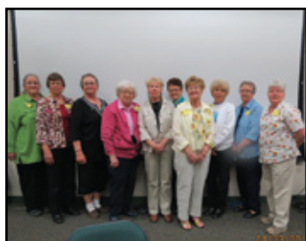
Nashua Gumbo Gals