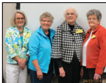
Chinook Jumping Junipers