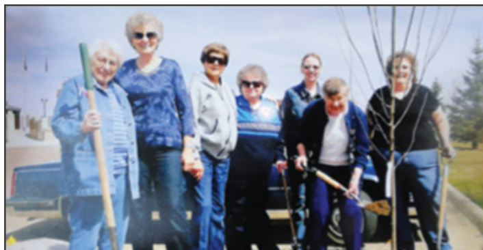
Members of the Rainbow Garden Club at their Arbor Day tree planting near the Blue Star Memorial

These are just a few projects, there are many more! As you can see, everyone finds ways to reach out to the community and share their love of gardening.