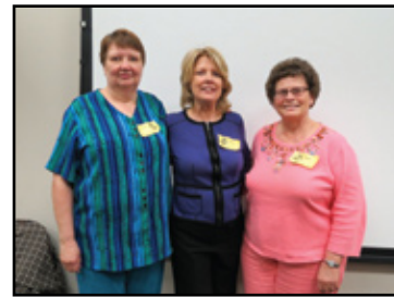
Havre Bullhook Blossoms