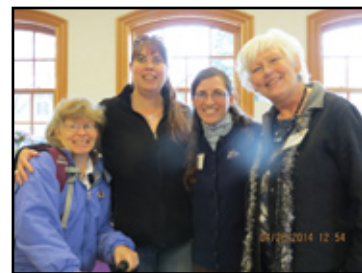
Helena Garden Club