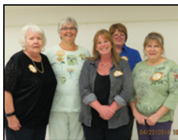
Miles City Garden Club