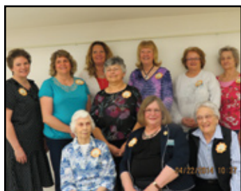
Glendive Garden Club

MFGC District meetings continued across the state in April and May. These included District 12–Eastern Gateway with the Glendive Garden Club and Miles City Garden Club; District 7–Hi Line with Gumbo Gals of Nashua, Bullhook Blossoms of Havre, Jumping Junipers of Chinook, and Malta Dirt Daubers; District 8–East Central with Lewistown Garden Club; District 10–Yellowstone with Hoe and Hope of Big Timber, Thumb-R-Green, and Sow and Grow; District 4–Lewis and Clark with the Belgrade Garden Club, Gallatin Empire Garden Club, Helena Garden Club, and Townsend Garden Club. District 3–Southwestern with the Dillon Garden Club, Anaconda Garden Club, Butte Garden Study Group and Whitehall Garden Club.