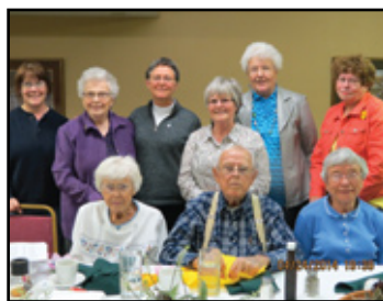
Lewistown Garden Club