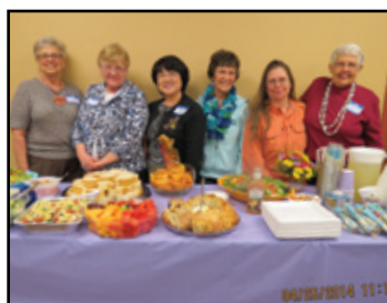
Big Timber Hoe & Hope