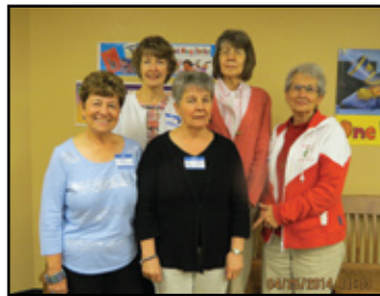
Billings Sow & Grow