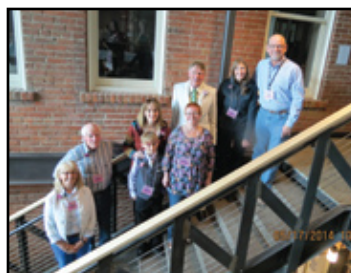
Butte Garden Study Group