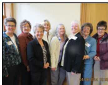
Townsend Garden Club