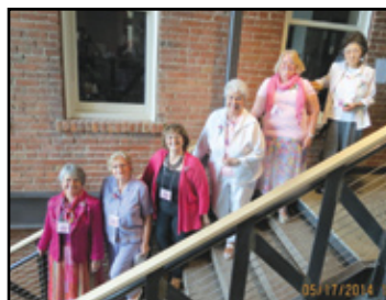
Whitehall Garden Club