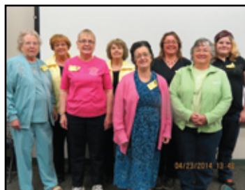
Malta Dirt Daubers