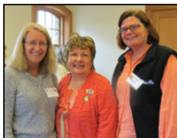
Belgrade Garden Club