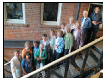
Anaconda Garden Club