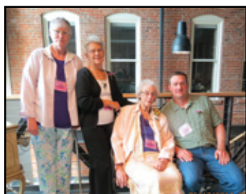
Dillon Garden Club