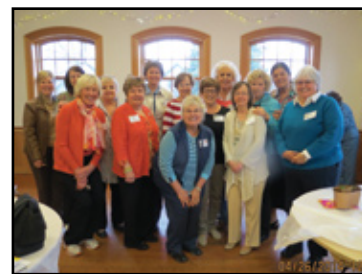
Gallatin Empire Garden Club